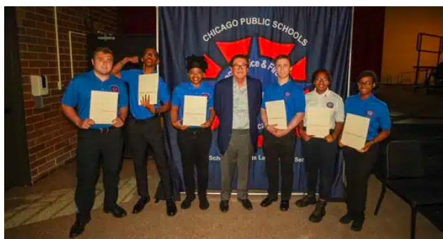
CPFTA scholarship awardees